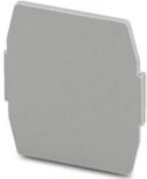
Separating plate, length: 22 mm, width: 0.5 mm, height: 22 mm, color: gray

Please be informed that the data shown in this PDF Document is generated from our Online Catalog. Please find the complete data in the user's documentation. Our General Terms of Use for Downloads are valid ( http://phoenixcontact.com/download )